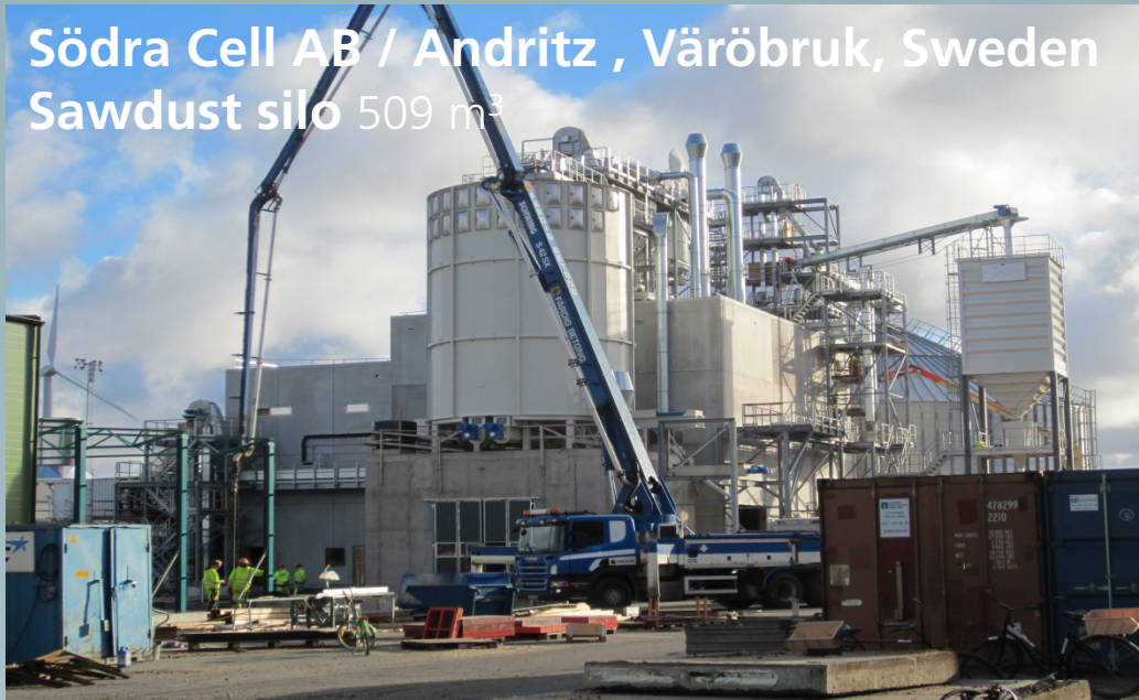
Södra Cell AB / Andritz , Väröbruk, Sweden Sawdust silo 509 m 3