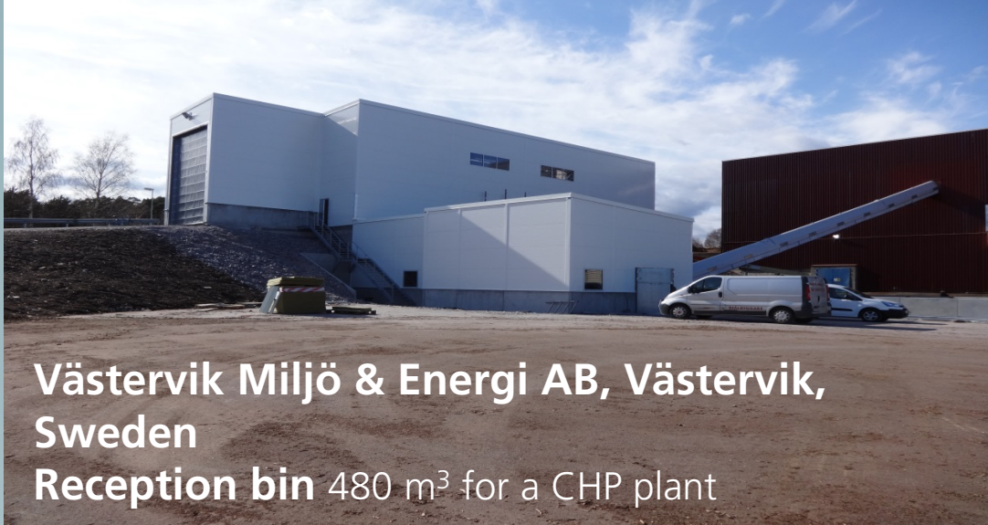
Västervik Miljö & Energi AB, Västervik, Sweden Reception bin 480 m 3 for a CHP plant