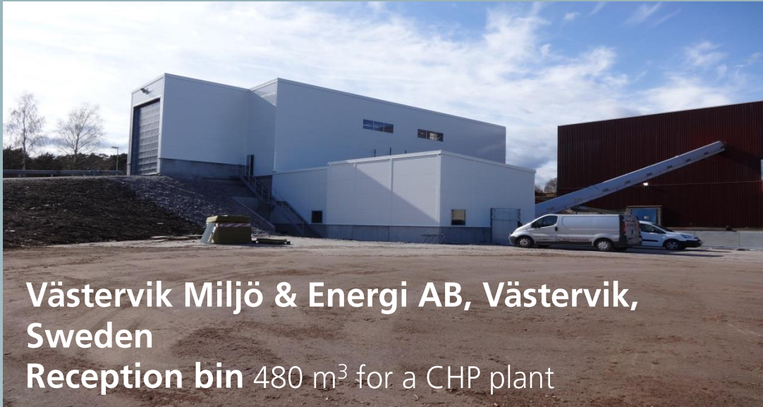
Västervik Miljö & Energi AB, Västervik, Sweden Reception bin 480 m 3 for a CHP plant